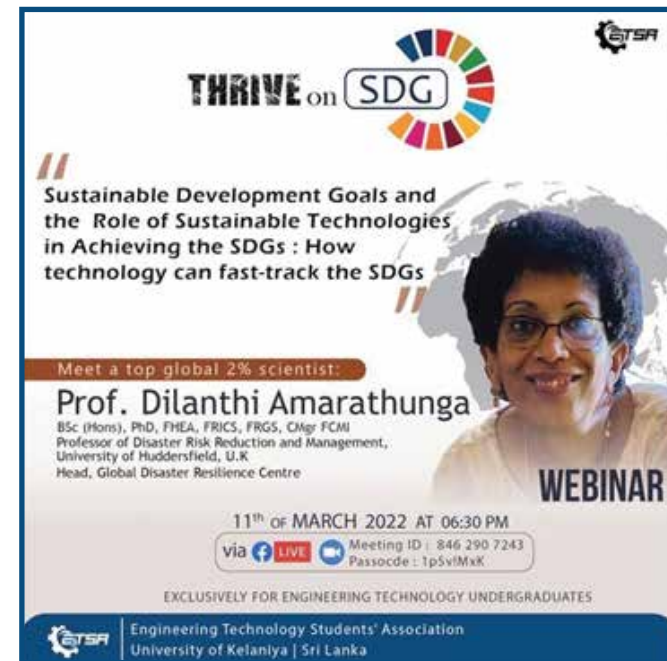
Figure 11 - E-poster of the project

Prof. Dilanthi Amarathunga was invited for the Launch of the Sri Lanka National Science Foundation (NSF) global digital platform (GDP) - State-of-the-art Global Digital Platform (GDP) which consists of requisite capabilities and features to harness, mobilize and channel intellectual assets at home and overseas. It was launched by the Prime Minister of Sri Lanka.