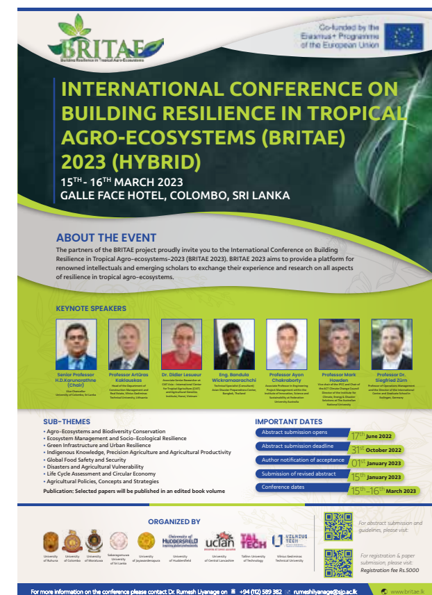
Figure 8 - BRITAE Conference flyer 2023 - 2