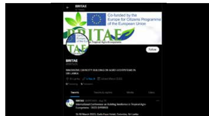
Figure 5 - BRITAE Twitter page