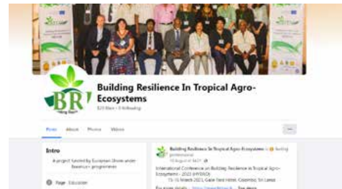
Figure 4 - BRITAE Facebook page

Twitter and LinkedIn accounts were created for the purpose of dissemination and exploitation.