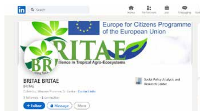
Figure 6 - BRITAE LinkedIn page

Under WP6, sub-task 6.6 highlights the organization of the International conference on Building Resilience in Tropical Agroecosystems. The title of the conference is “International Conference on Building Resilience in Tropical Agro-Ecosystems -2023”. A draft of the conference flyer was