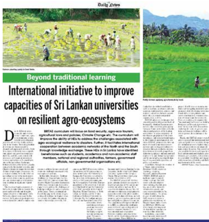
Figure 9 - Daily News Newspaper article, Published on 28th May 2022

Further, a newspaper article was published in English and together with translations in Sinhala and Tamil. It was also uploaded to the BRITAE and SPRAC websites. It was sent to be uploaded on websites of partners too.