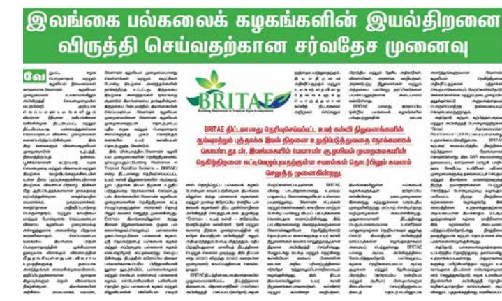
Figure 10 - Thinakaran Newspaper article, Published on 27th June 2022

All BRITAE partners engage in dissemination and exploitation activities such as by linking the project website and social media pages of their respective university or acknowledgement of the BRITAE project in published journal articles, conference presentations and publications.