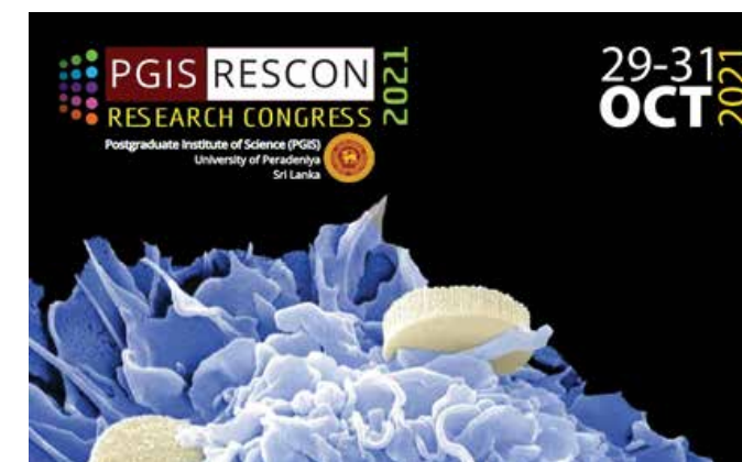
Figure 3 - Postgraduate institute of science research congress (PGIS RESCON 2021) flyer