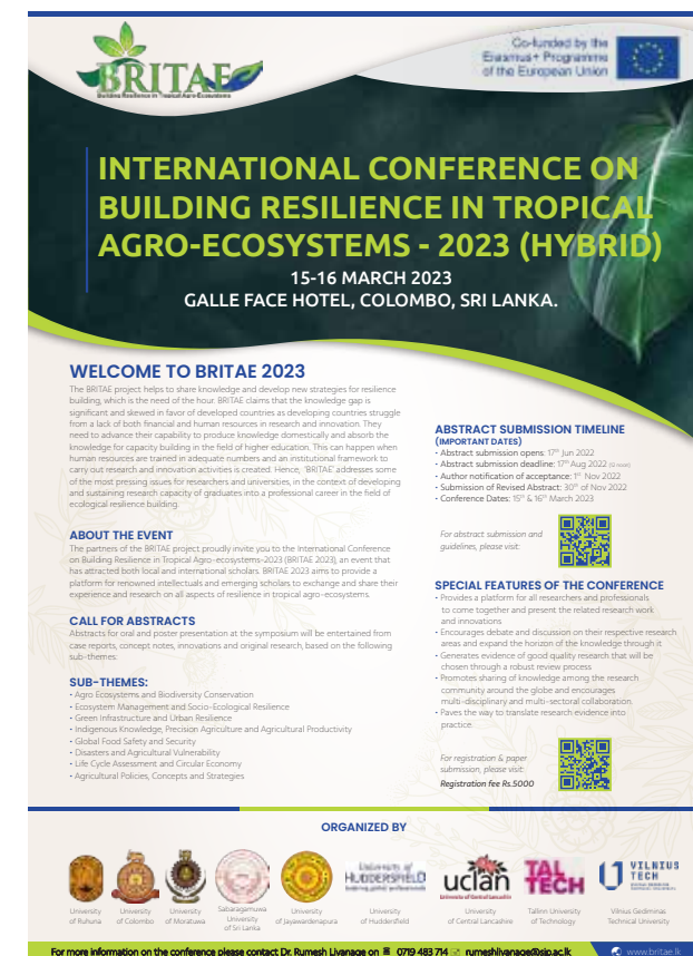
Figure 7 - BRITAE Conference flyer 2023 - 1

Under WP6, sub-task 6.6 highlights the organization of the International conference on Building Resilience in Tropical Agroecosystems. The title of the conference is “International Conference on Building Resilience in Tropical Agro-Ecosystems -2023”. A draft of the conference flyer was